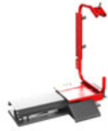
BJ-05 Wheel Lifter