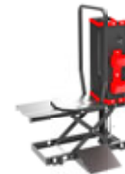
BJ-09 Wheel Lifter